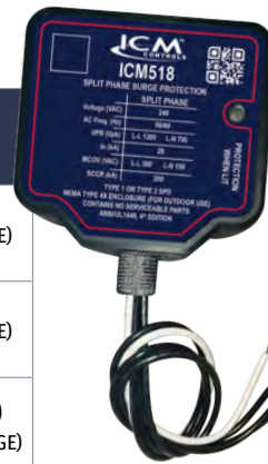
ICM518 Whole home Surge Protective Device