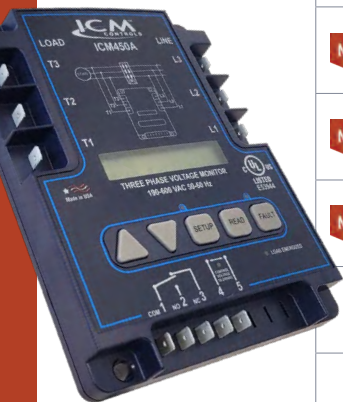
ICM450A Programmable 3-Phase Voltage Monitor